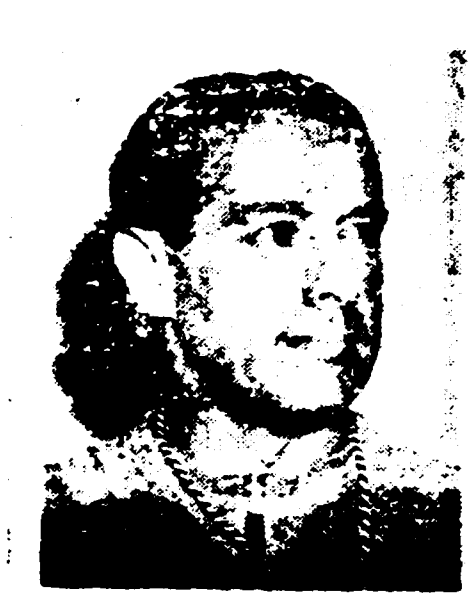
Nat Holman Leaas resistance movement